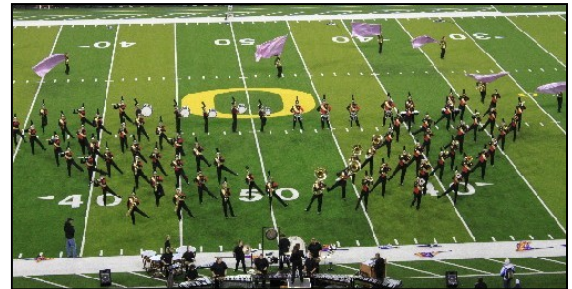
Cheney High School Marching Band