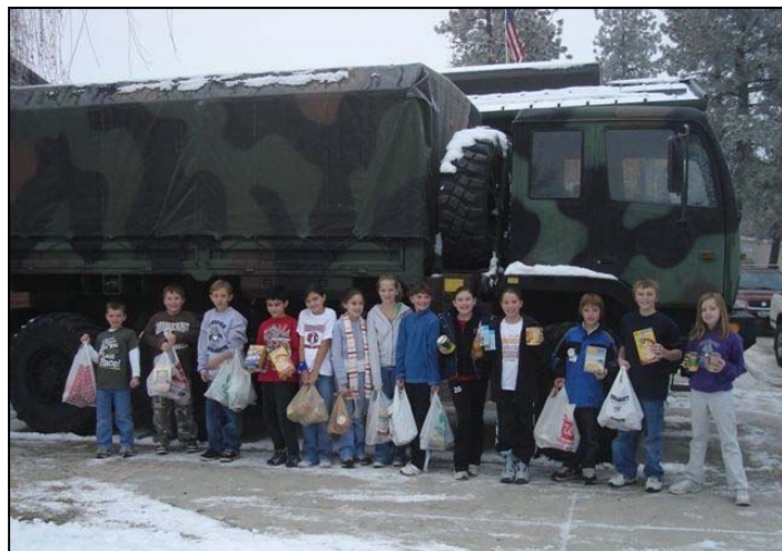
Windsor Wildcats and the truck they filled

In December, ASB officers and room representatives organized a food drive to benefit the Great Harvest Food Bank. In a matter of three to four weeks, Windsor Wildcats managed to fill a Washington Air National Guard truck with canned and boxed goods to benefit those in need. Filling the truck with food has been a tradition at Windsor and each year is more successful than the last. Windsor Wildcats, with their big hearts, come together to help the surrounding communities throughout the year. Coming up, Windsor will support their annual sock drive, penny drive for the Spokane Guild School, and the pet food drive for all those needy pets in Spokane.